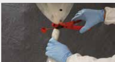
Cut and separate