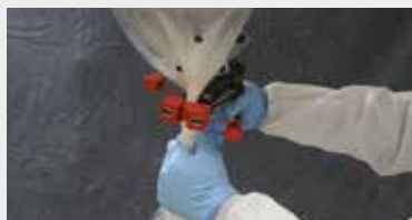
Squeeze tool until crimps are engaged—then release tool