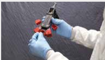
Load crimp into installation tool

ILC Dover crimps have been designed and tested to compress standard diameter liners made with ArmorFlex® film