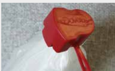
Install crimp cap on crimp body